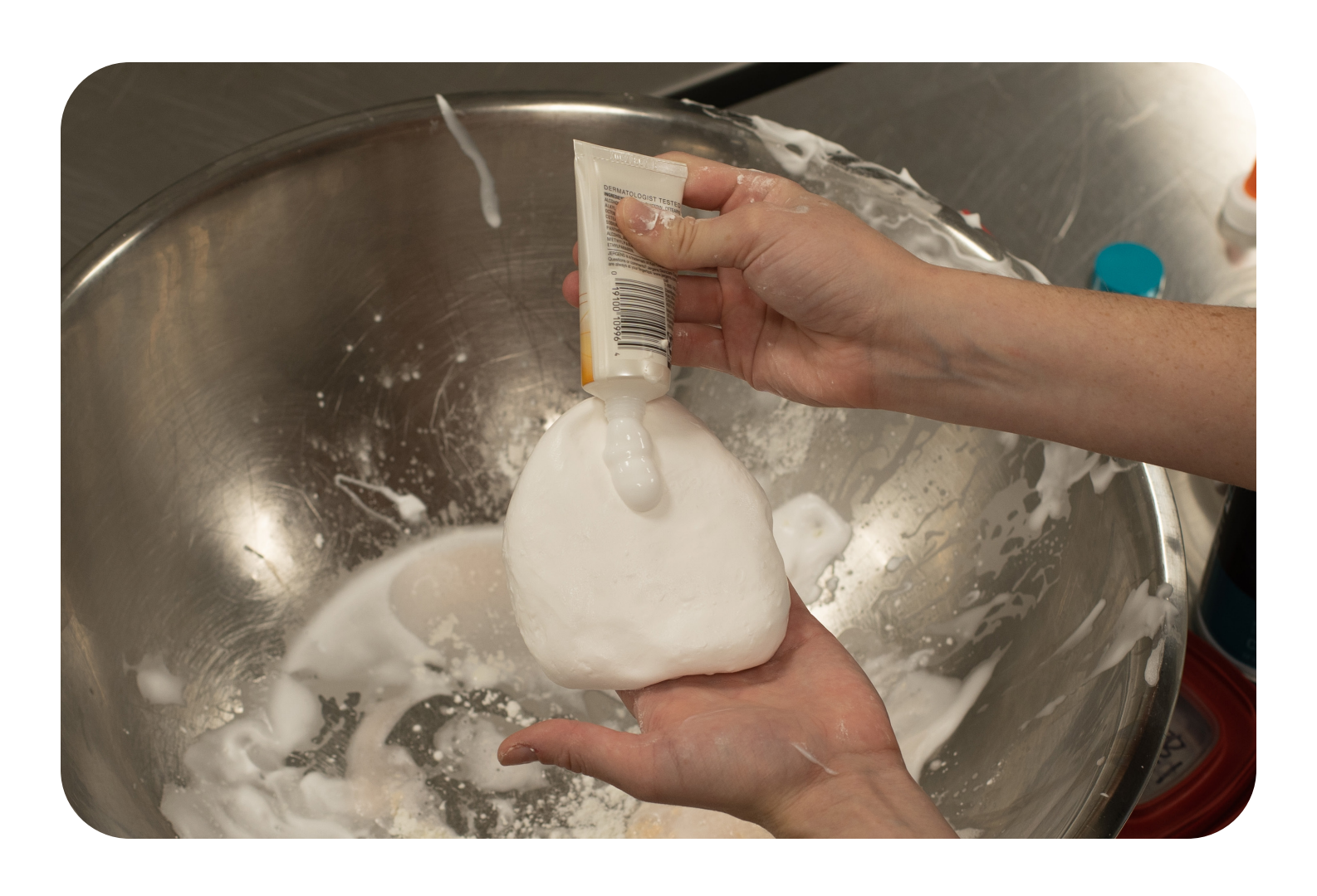
Add a few pumps or a glob of hand lotion.